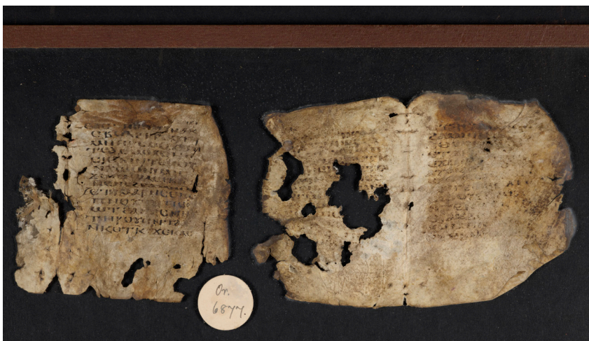
From the British Library Collection: Or. 6877 flesh side.