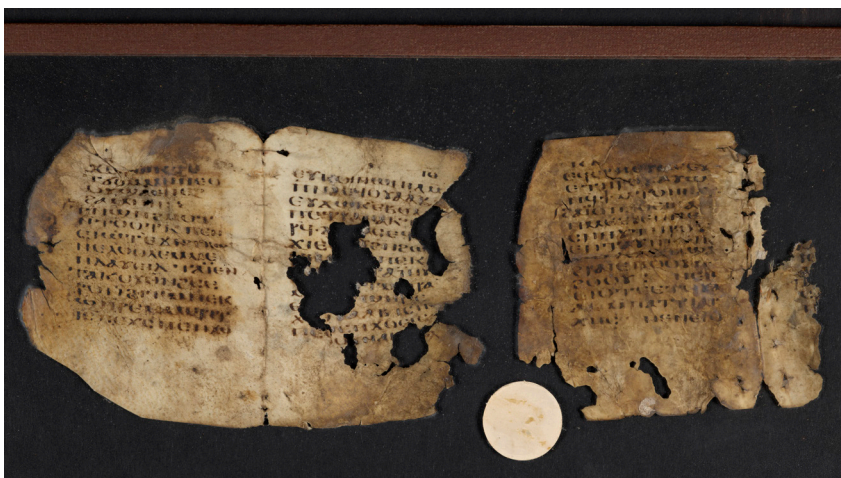
From the British Library Collection: Or. 6877 hair side.